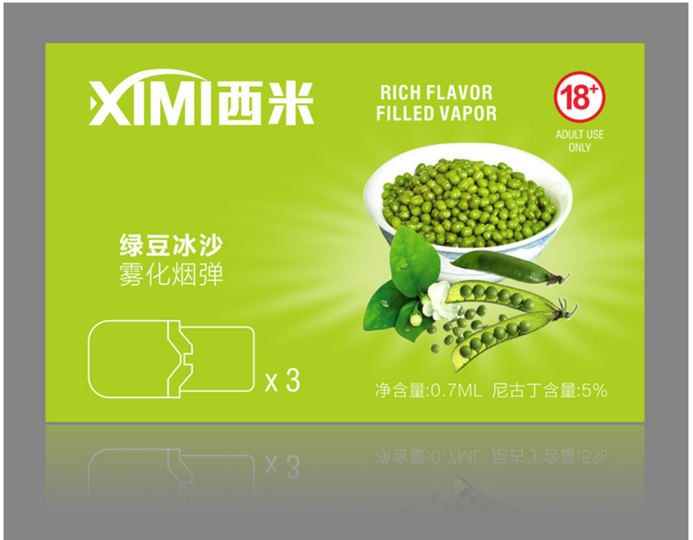
电子烟包装设计 烟油包装设计 雾化器包装设计

We exclusively focus on brand VI design, brand packaging design, brand logo design, and subsequent brand promotion and visual management for consumer electronics products. Url: https://www.packagingpeak.com/en/work-p622.html